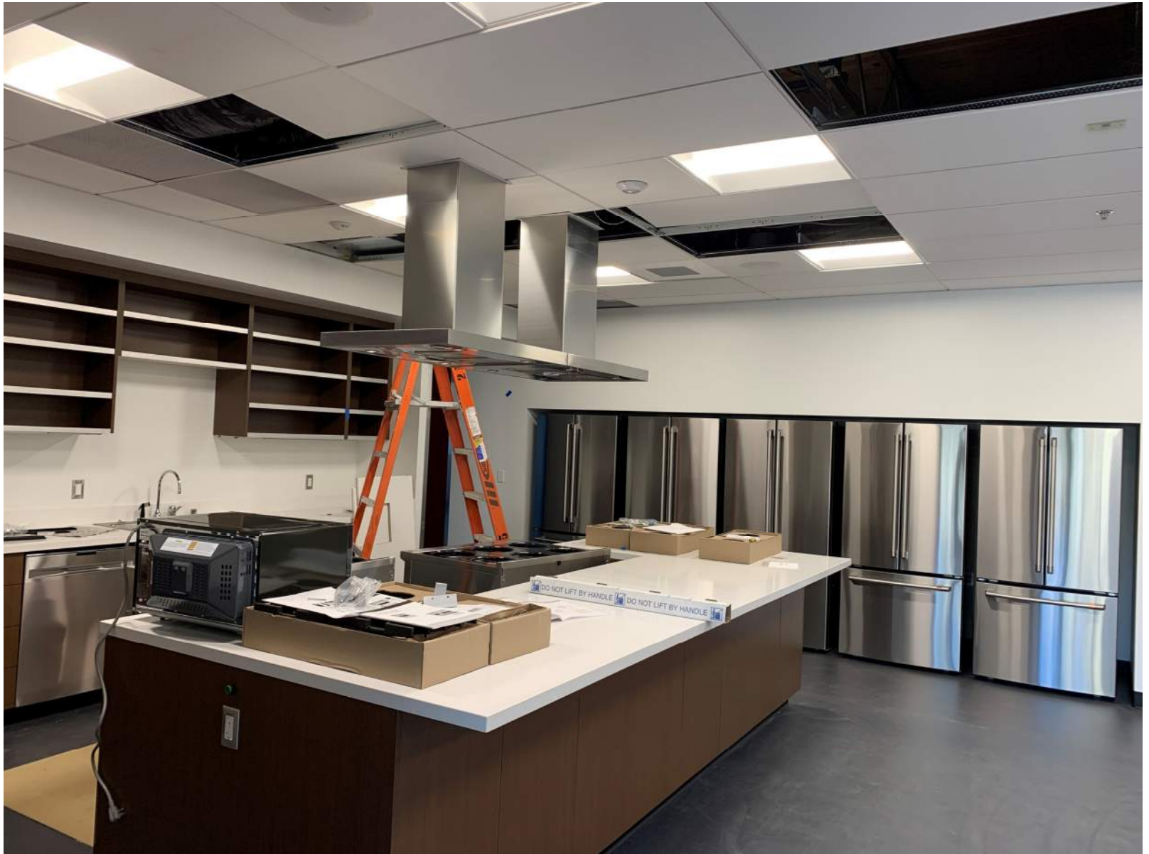
Fire Station 42 – Depicting the final install of the appliances in the Beanery.