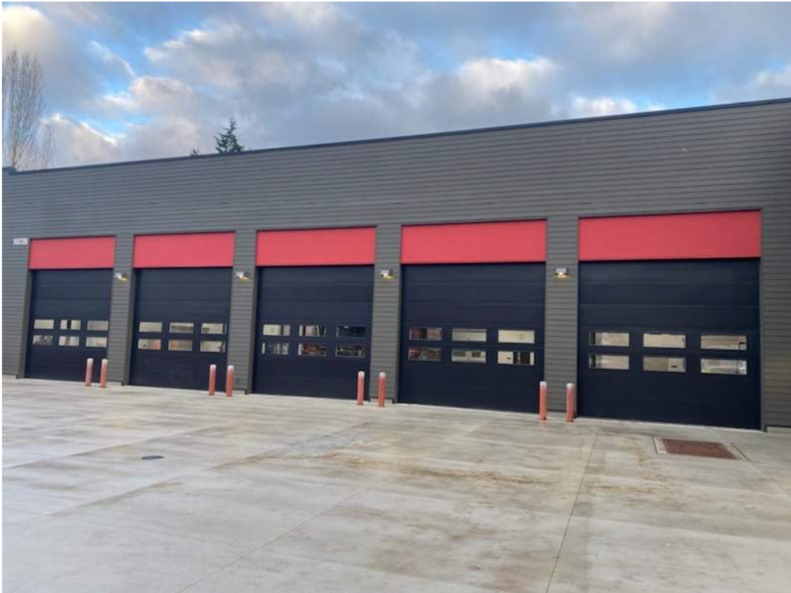
Fire Station 42 - The five doors to the Apparatus Bay where engines/equipment are stored.