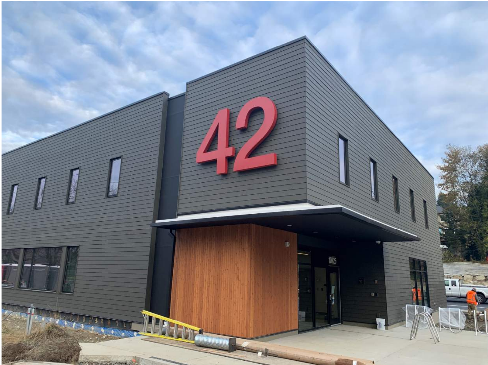
The completed signage for Fire Station 42's main entrance.