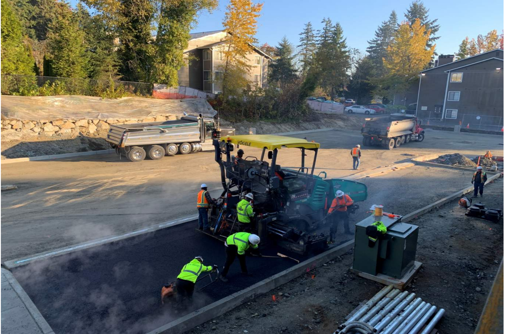
Fire Station 42 – Completing the parking lot on the west side of station.