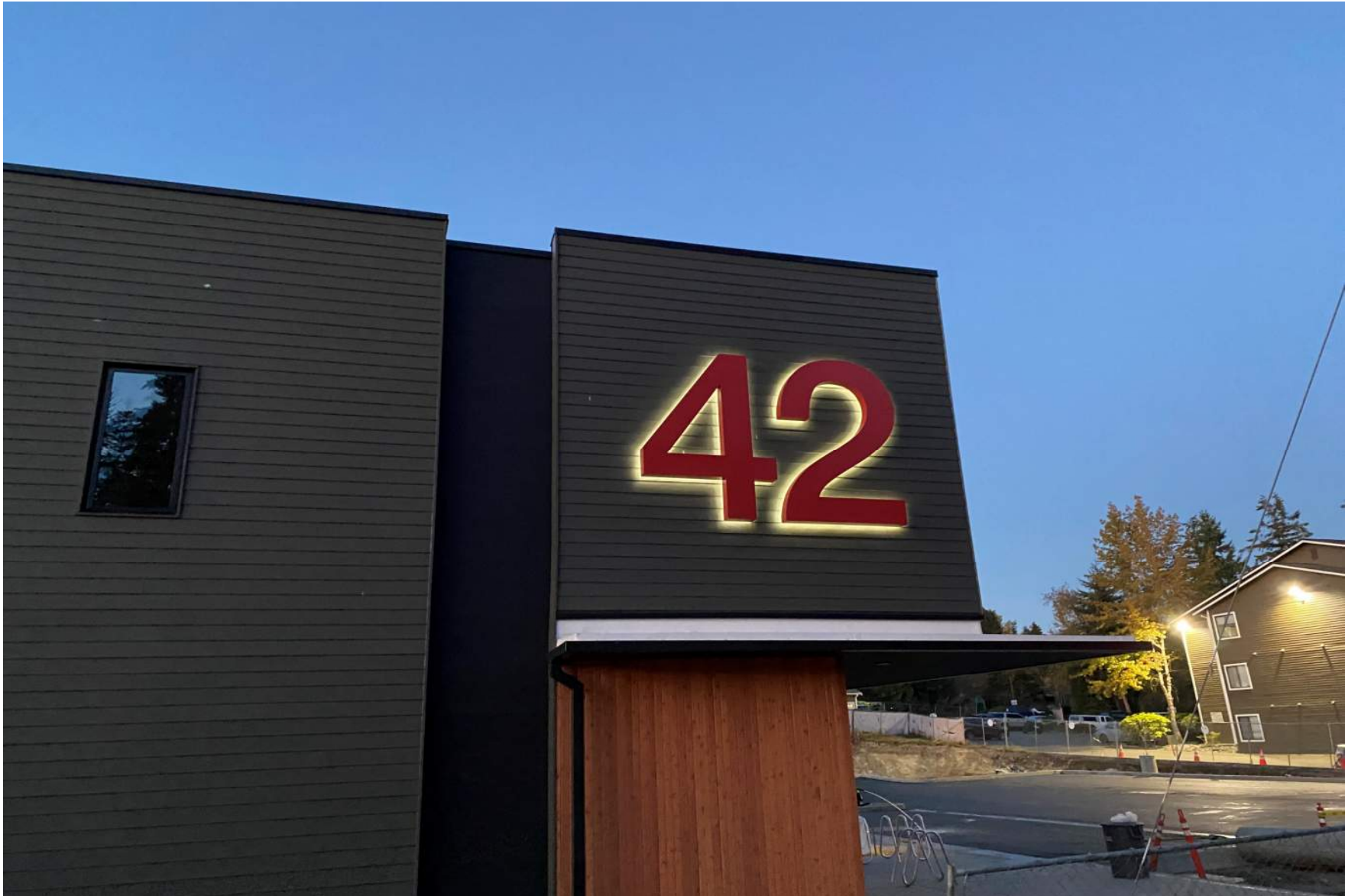
Fire Station 42 – The illuminated signage at the main entrance, facing Beardslee.